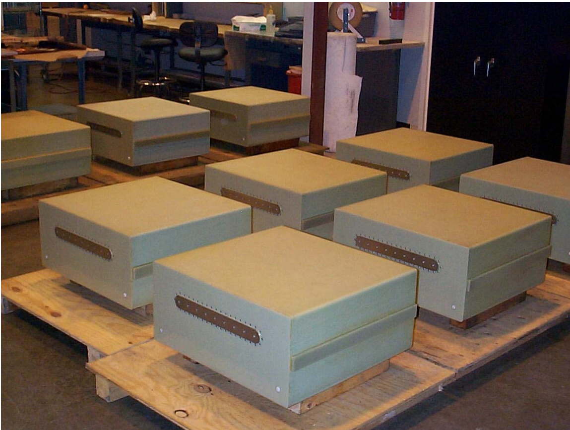
Figure 3. FASTCAP Model 39232 capacitors being prepared for shipment to Los Alamos.

For fast Marx generator applications, GAEP has been supplying Type “FASTCAP” -- large capacitors with an insulating case (e.g. fiberglass) with rail terminals, since 1986. Capacitors with rated voltages of 60 to 180 kV have been built; in some instances, two capacitors are enclosed in one case to minimize the inductance between them. The rail terminals have been designed to mate directly to low inductance railgap switches. The dielectric is high density Kraft paper, and multi-section extended foil windings are used. Application of these fast Marx generators is typically in large physics research facilities, where megavolt, megamp pulses are used to generate plasmas and X-ray radiation. Further development of this technology for future radiation effects experiments is currently underway.