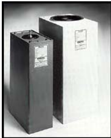
Figure 1. Type C capacitors, illustrating standard low profile bushing configurations.

Type C capacitors are large capacitors in fabricated, welded steel cases. Typical Type C capacitor cases range from 7-1/4 x 14 x 25 inches to 12 x 16 x 28-1/2 inches. A variety of high voltage terminals, current returns, and mounting schemes are available.